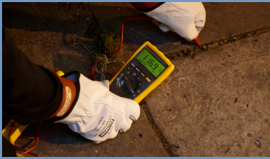
Record observations and measurements at fault locations