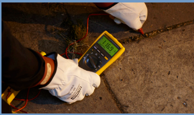
Record observations and measurements at fault locations