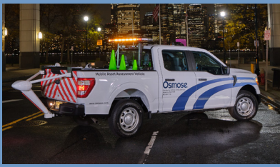
Survey underground for fault conditions