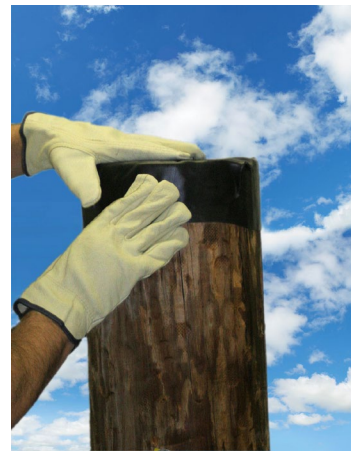
Step 4: Completed application

*Nails may be used to secure tabs in damp or cold conditions that may affect adhesion but are not required.