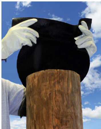
Step 2: Center and adhere to top